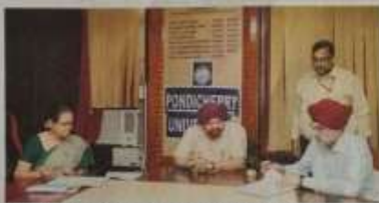
The twinning/learning support centre is an innovative educational concept of the Directorate of Distance Education of Pondicherry University.

The approach helps distance mode students to get an overview of each subject