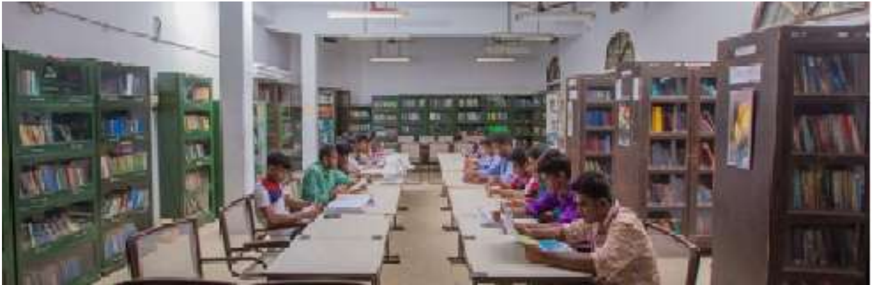
Guru Nanak Library